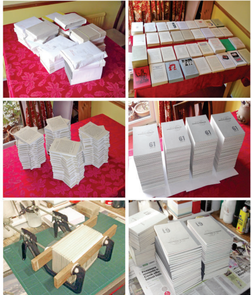
Assembling the 2015 edition took about two weeks: (a) A heap of parcels from around the world. (b) Pages ready for collating. (c) Pages collated and stacked. (d) Covers and prelims added. (e) Binding. (f) Completed books.

The nature of the contributions has changed only a little since the early issues. Pages of body text are becoming less common from the letterpress printers but some beautiful typography is appearing from skilled computer users. Mike Elliston's dictum was that it doesn't have to be letterpress but should look like it: not only is it a small world, but a traditional one. The subject can be anything